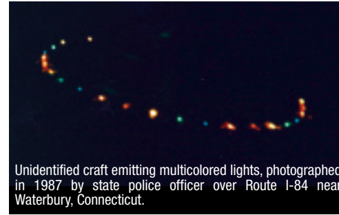
Unidentified craft emitting multicolored lights, photographed in 1987 by state police officer over Route I-84 near Waterbury, Connecticut.